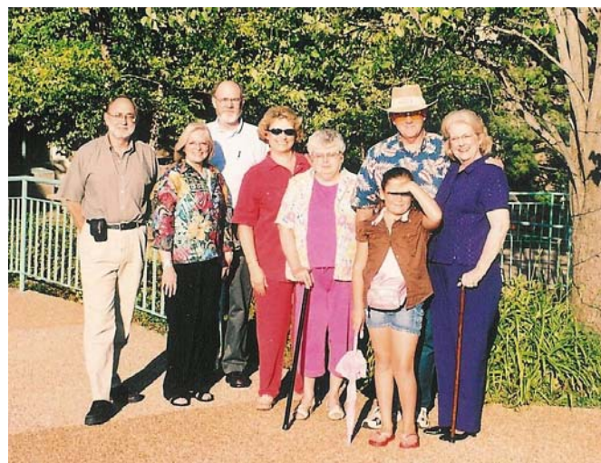
Andy Williams’ Moon River Theatre

On Thursday evening, twenty of us were amazed by the showmanship of fiddle virtuoso Shoji Tabuchi, and on Friday evening 27 of us reveled in the star power of the Andy Williams—Glen Campbell Show.